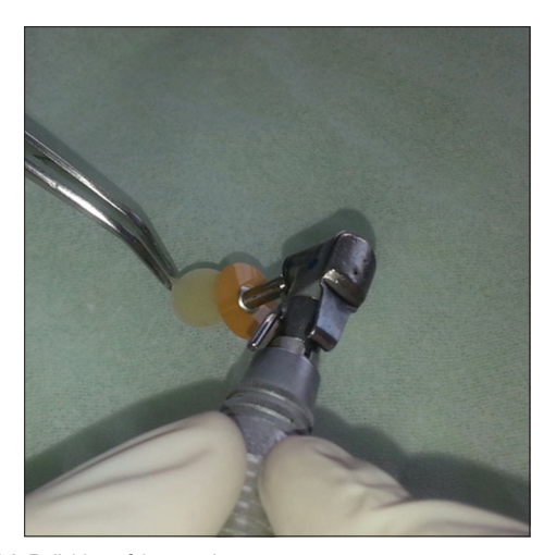
FIGURE 1. Polishing of the specimens.

Fifteen cylindrical samples of each resin composite were prepared using a metallic mold (2 × 10 mm). A microscope glass slide and transparent Mylar® strip were placed under the mold, and the material was packed and covered with another polyethylene terephthalate strip and the glass plate. The samples were light-cured using a wireless LED lamp (Elipar<sup>™</sup> FreeLight 2 LED Curing Light, 3M ESPE, St. Paul, MN, USA) with light intensity >1000 mW/cm<sup>2</sup> for 20 s. Dry finishing and polishing of the specimens were accomplished sequentially, using fine (24 \mu m) and superfine-grit (8 µm) Sof-Lex polishing disks (3M, ESPE, St. Paul, MN, USA), a new for each specimen (Figure 1). The aluminum oxide polishing disks were inserted in a lowspeed dental handpiece with air cooling (at 10.000 rpm), used with repetitive strokes, by applying light pressure on the specimen surface for 10 s per grit. All polishing disks were disposed of after each use. Following the preparation, to complete the polymerization process, the samples were stored in glass containers with distilled water, at 37°C, for