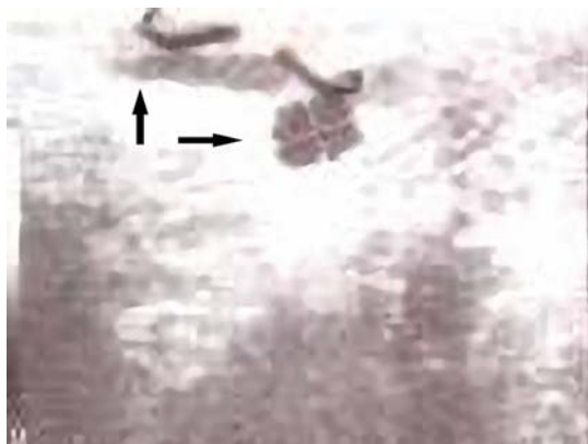
FIGURE 3. Postoperative control scrotal ultrasonogram, the size of epididymal cyst on the right epididymis is 4,5x3mm. Upper arrow shows vaz deferens, the other shows cyst.

geon for postoperative check-up. Physical examination showed a round small cyst palpated on the right epididymis while left hemiscrotum was without any pathological findings. A scrotal ultrasonography was performed which revealed a cyst in the right epididymis measuring 4.5x3 mm. (Figure 3).