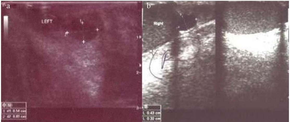
FIGURE 1. Ultrasonographic view of epididymal cyst. a. On the left side, left epididymal cyst size 9x7mm, b. On the right side right epididymal cyst size 4,5x3mm.