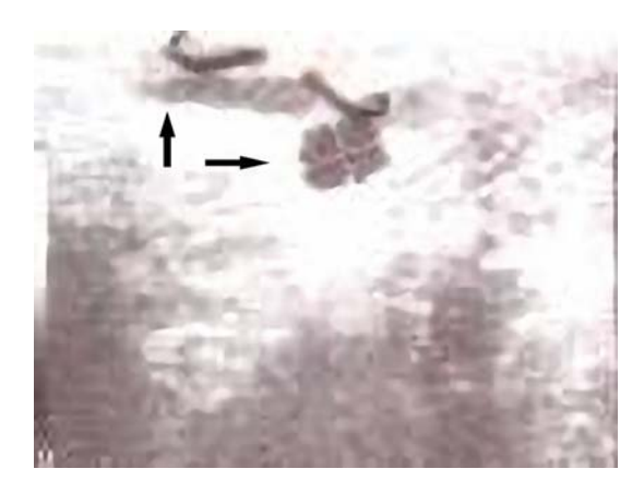
FIGURE 3. Postoperative control scrotal ultrasonogram, the size of epididymal cyst on the right epididymis is 4,5x3mm. Upper arrow shows vaz deferens, the other shows cyst.

geon for postoperative check-up. Physical examination showed a round small cyst palpated on the right epididymis while left hemiscrotum was without any pathological findigs. A scrotal ultrasonography was performed which revealed a cyst in the right epididymis measuring 4.5x3 mm. (Figure 3).