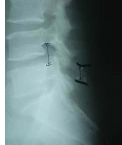
FIGURE 1. Preoperative (left) and postoperative (right) lateral roentgenograms. (Lateral roentgenograms after implantation of interspinous device shows separation of the posterior elements with accompanying unloading of the facet joints, widening the intervertebral foramen and thus decompressing the vertebral canal and relieving the load on the disc).